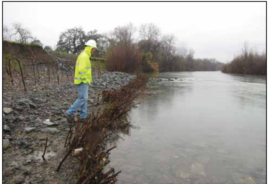
The Russian River project after high flows recede. Note the rock, the live siltation and the pole plantings are still in place. January 13, 2011

I have designed, built and documented many projects where “clean”, self-launching rock was strategically placed (some-