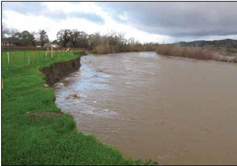
On December 29, 2010, 2 months after completion the Russian River at Geyserville Bridge gets high flows (>10,000 cfs), 9 ft. over the Rock Vanes.

under these conditions? The Water Quality Certification and 401 permit can be many pages long and require rigorous monitoring. How effective and expensive are “isolation techniques”? We all realize, I hope, that putting a silt fence in a live stream is