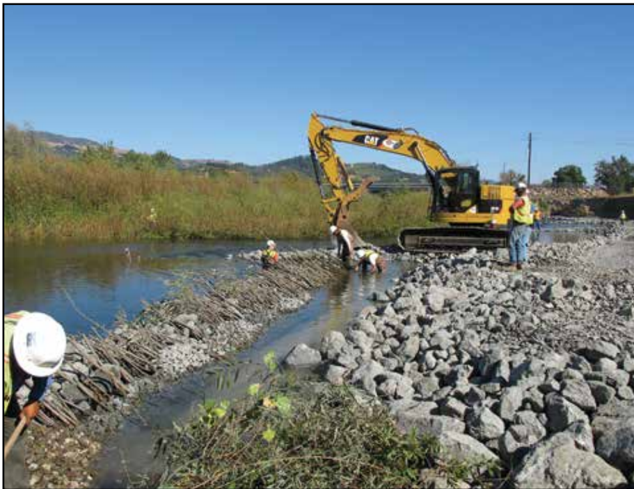
Geyserville Bridge project installing Live Siltation behind LST. Note how the self-filtering gradations minimize turbidity.

In 2002 the TRB and National Cooperative Highway Research Program (NCHRP) issued an RFP for research and development of guidelines and design criteria for methods determined to be “environmentally-sensitive”. The 3-year research, conducted by Donald Gray, Doug Shields and myself was reported and published as NCHRP Report 544 – Environmentally Sensitive Channel and Bank Protection Methods (McCullah and Gray, 2005). A version of this report titled ESenSS was also published separately (McCullah, 2005). Over 50 environmentally-sensitive methods were presented with design criteria, typical drawings, construction specifications, costs and much more. NCHRP