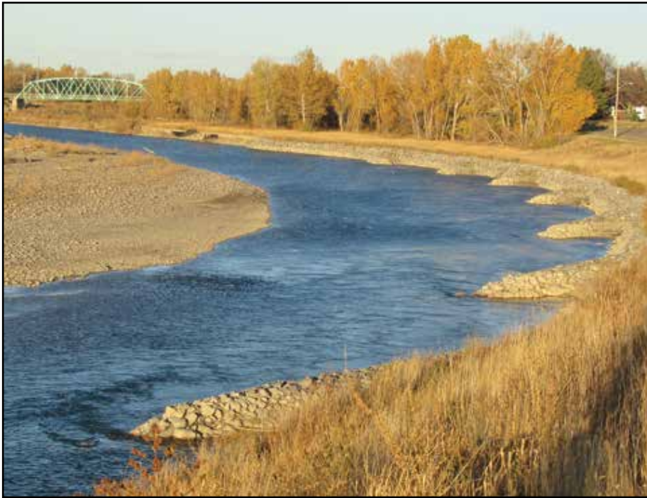
Above: Rock Vanes on Old Man River, 3 years after installation. No damage from record storm. Below: Old Man River, Fort Macleod, AB. Seven months after construction, the Rock Vanes and Flood Terrace experience a 30-yr flood. The high erosive energy and thalweg is directed streamward off the ends of the vanes.